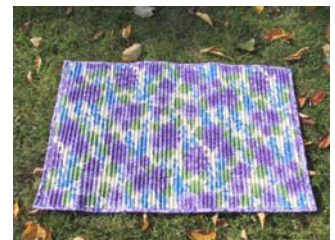
Groovy Baby (front and back) Size 20" x 32"

Front: 1 yard Back: 1 yard Binding: 1/4 yard Batting and Cotton Upholstery Piping or Clothesline